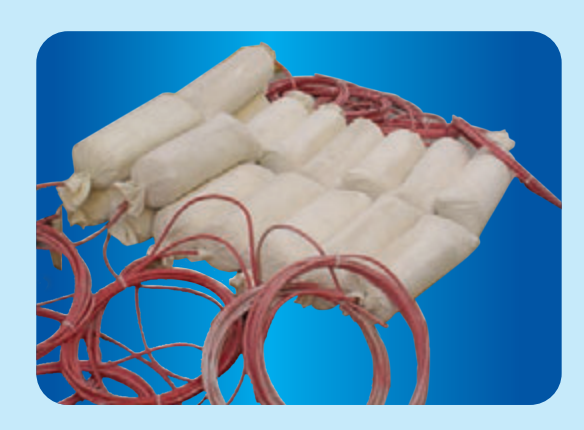
Zinc Grounding Cell