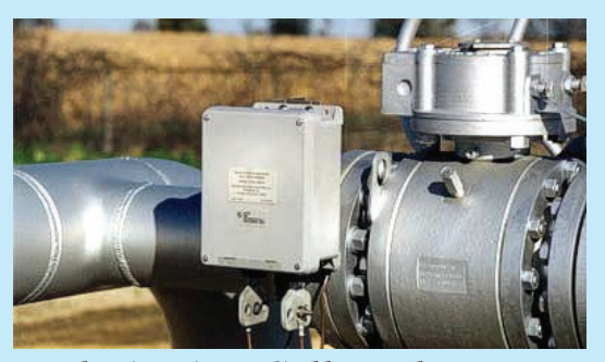
Polarization Cell Replacement (PCR)